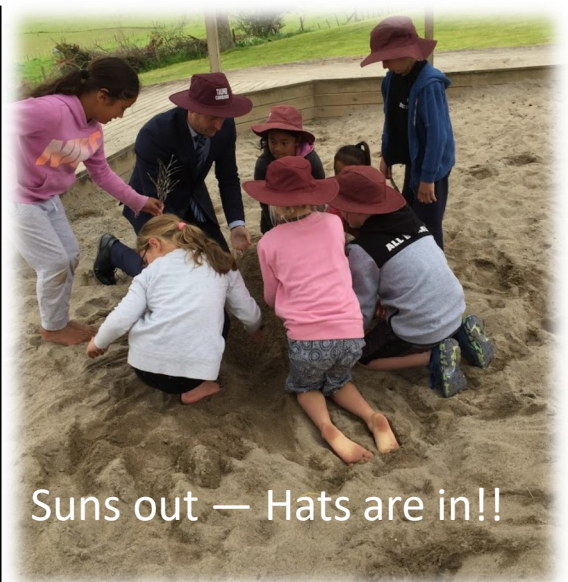
Suns out — Hats are in!!